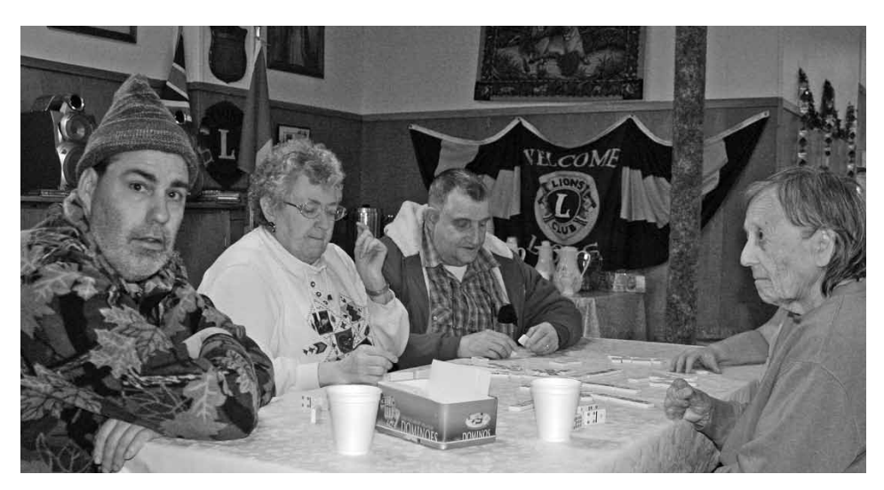
The work crew at St. Paul's enjoyed their own chili and then went on to host a games afternoon.

T. PAUL'S Anglican Church in South Porcupine decided to support the community's annual Winter Carnival this year as it has in the past. This support took two forms. The first was a chili lunch prepared in the kitchen of Canon Gibson Hall by members and friends of the congregation. The public was served a fine, hot meal and the proceeds generated by this meal went to support the parish's foster child in Ethiopia. The meal was followed by a games' afternoon which was offered to persons 55 years of age or better. Dominoes, cards, and board games were available to one and all. A particularly popular domino game called 'chickenfoot' engaged many from the