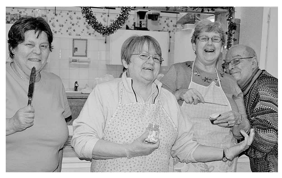
The work crew at St. Paul's served chili and then played chickenfoot to their hearts' content.