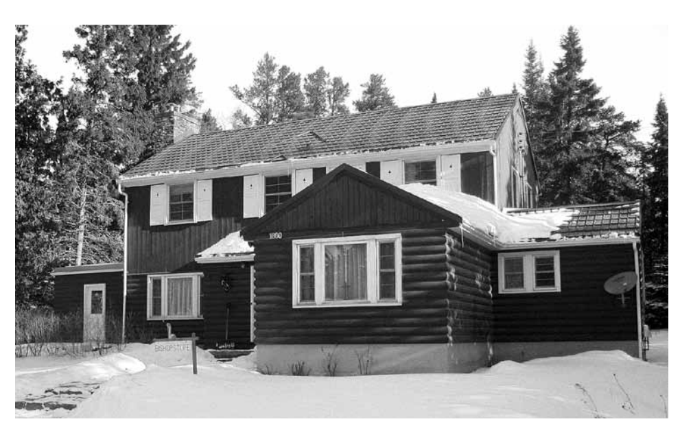
Bishopstope, the residence of the Bishop of Moosonee, is to be sold.