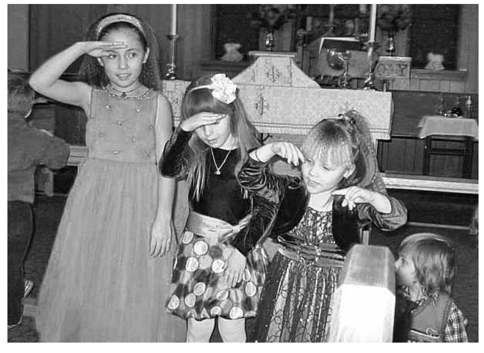
The Kids' Club singing at St. Luke's on Christmas Eve.