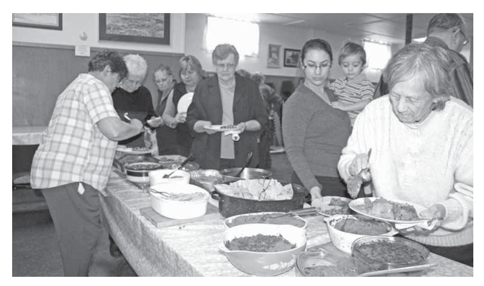
The people of St. Paul's enthusiastically participated in the history of the Eucharist and took part in the Lord's supper - just as He did!