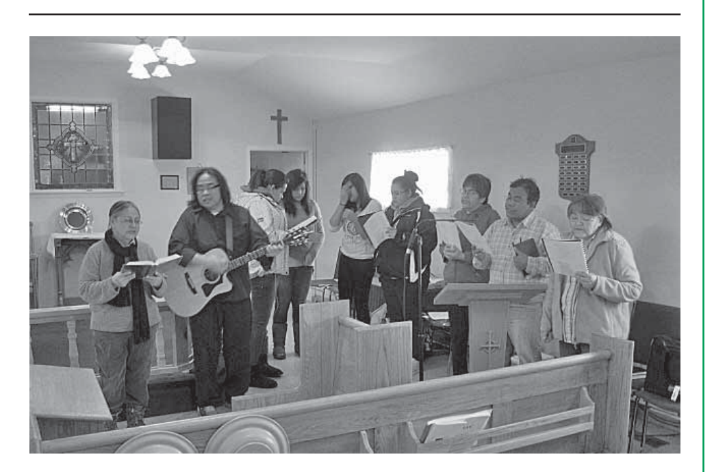
The Moose Factory Singers made a joyful noise at the Great Chapter meeting in Mistissini.