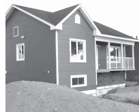
Wemindjii's new Rectory.