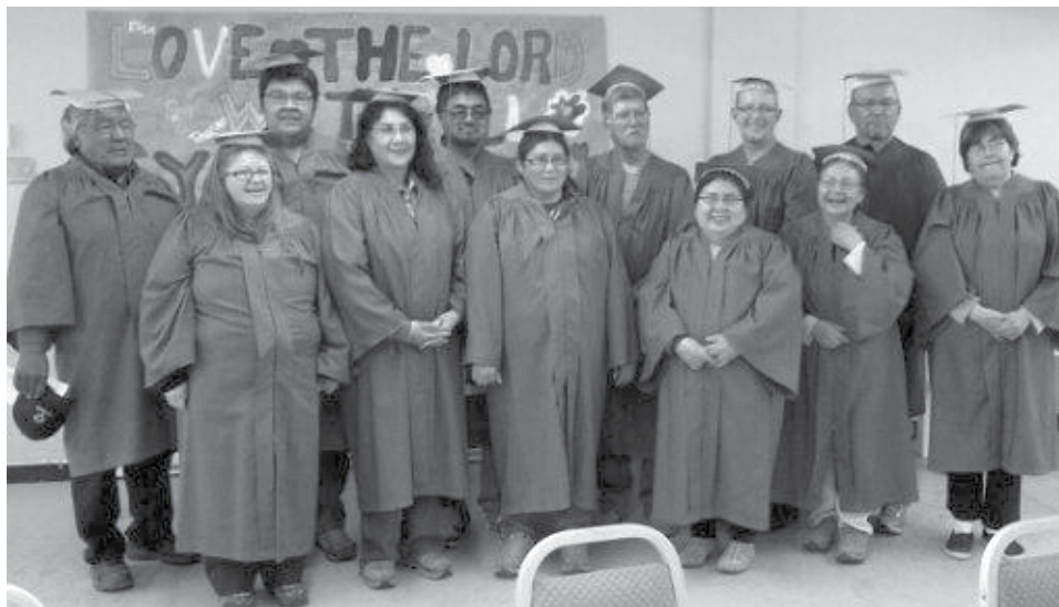
The 2012 Graduating Class from the Diocese of Moosonee's School of Ministry in Wemindjii, Quebec.