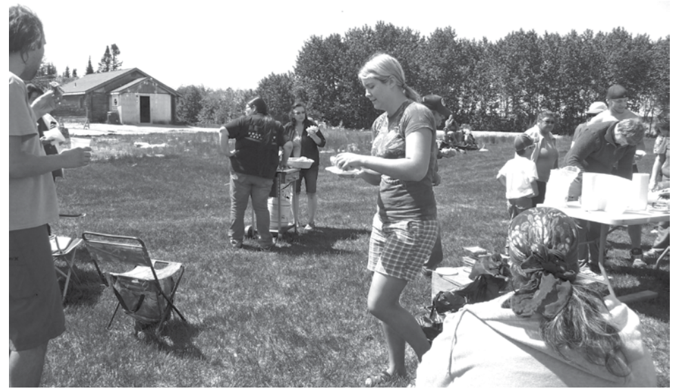
The people of Eastmain, wished their church, St. Mark's, a happy 40th birthday and celebrated with a community meal and picnic open to one and all.