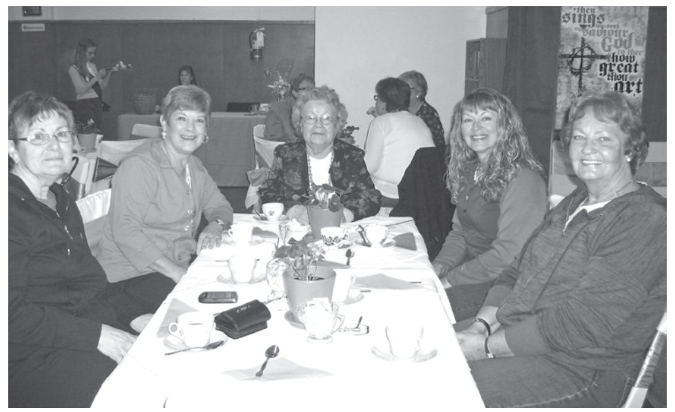
Many ladies from the community came to enjoy the Mothers' Day Tea held at St. Paul's in South Porcupine - it was a time of good fellowship for one and all.