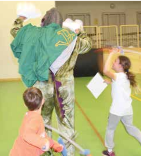
The cowardly dragon fled before the swords of the righteous.

School in Timmins. The kids were ready to reprise the role of St. Michael as they artfully smacked that old dragon around ... some of them even had two swords! The dragon