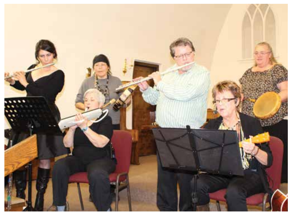
A 'medley' of musicians brought delightful music to the ears of the people of St. Peter's and Kirkland Lake.