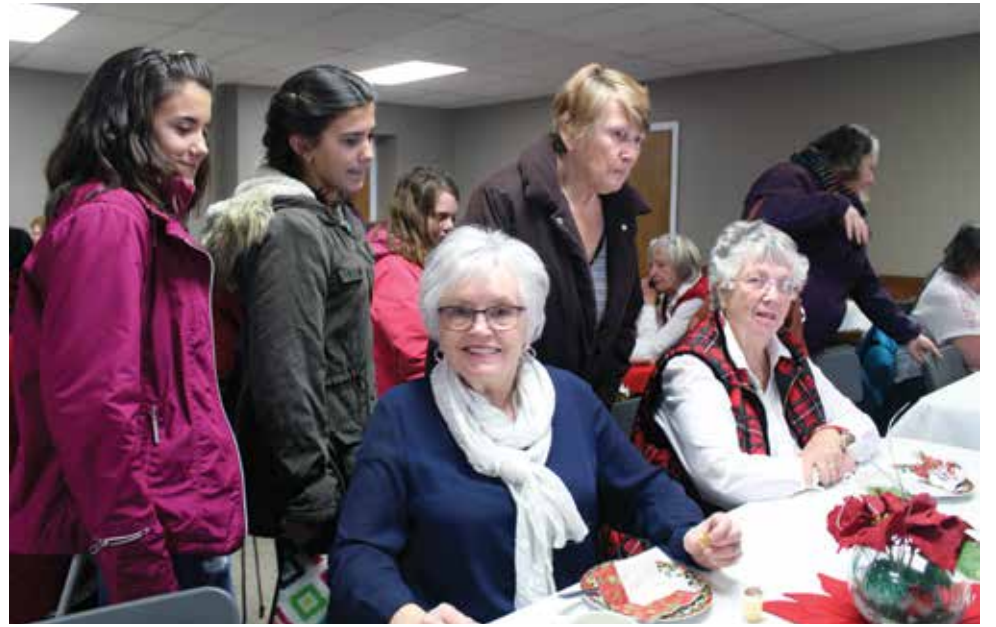
The Christmas tea and bazaar was soundly supported by the wider community in Timmins.