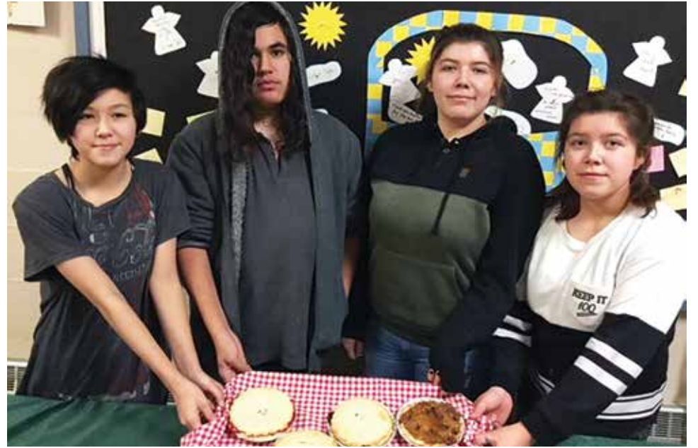
Youth of Holy Trinity parish baked 'monster cookies' to buy goats for PWRDF.

Meaningful ministry is based upon a partnership of knowledge, faith, and resources. Knowledge & Awareness = Support & Change. With the support of PWRDF website and local representative in our diocese parishes can create their own PWRDF initiatives. These can be tailored to particular parish interests and styles of engagement. No goal is too small; we look forward to hearing what initiatives you come up with!