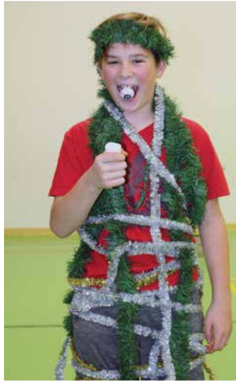
This young man found a different way to shine light on St. Lucia.