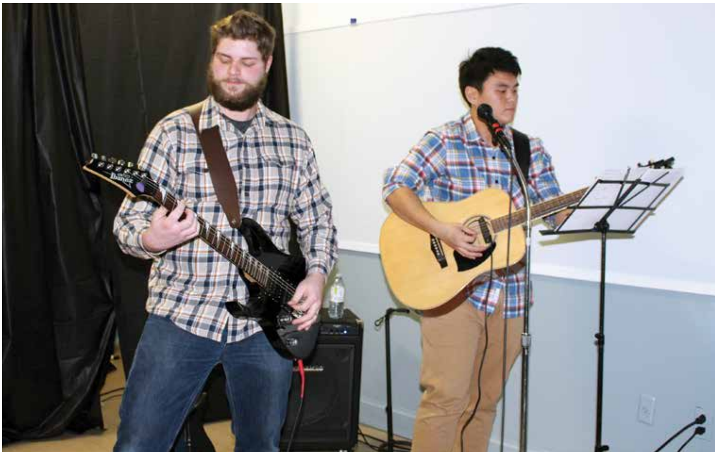
The Northern Rock Group, Reminiscing the Future, brought Christian rock music to St. Peter's on-the-Rock's new Rock Café on their opening night.

THE NEWSPAPER OF THE DIOCESE OF MOOSONEE • www.moosoneeanglican.ca • A SECTION OF THE ANGLICAN JOURNAL • MARCH 2018