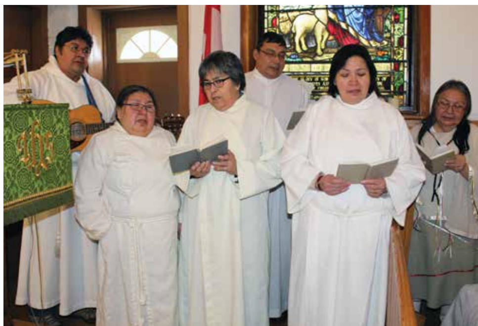
Musicians, choristers and graduates from the James Bay Region provided beautiful music at the Sunday worship service and graduation at Holy Trinity.