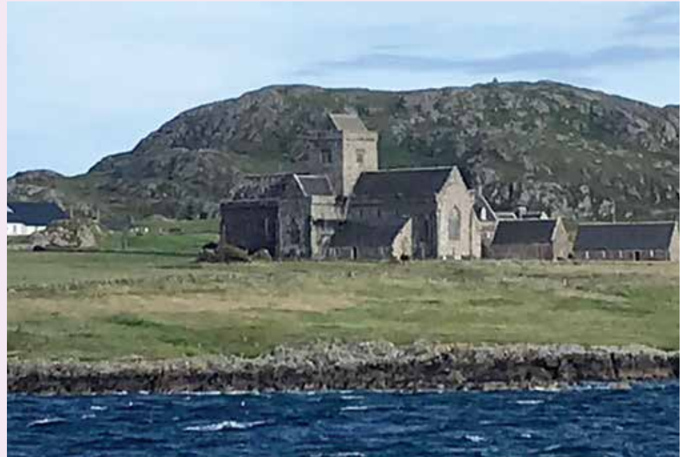
Iona Abbey in the Scottish Hebrides is one of the oldest Christian centres in all of Western Europe and a focus for many pilgrims.

All too soon we were scheduled to leave and on July 22nd, 2019 we made our way to the Isle of Mull via Glasgow and Oban. We met up with the other Christian Orthodox pilgrims and made our acquaintance with Sister Helena. Our home for the next six days was a simple but modern house with a chapel on site. Our day started with a Eucharist service followed by breakfast. We were then off to explore various sacred spaces associated with Celtic saints, with the Isle of Iona and