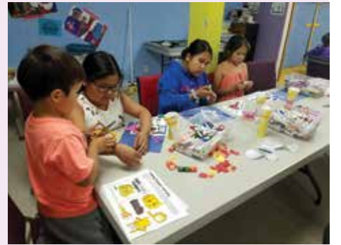
The Sunday School children created many items to support the Scary Stories. I felt like we were camping even though we were inside the church.

When I told these stories inside the tent with the children, we really