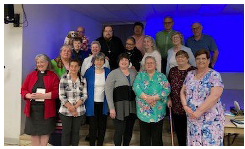
A group of students enrolled at the School of Ministry