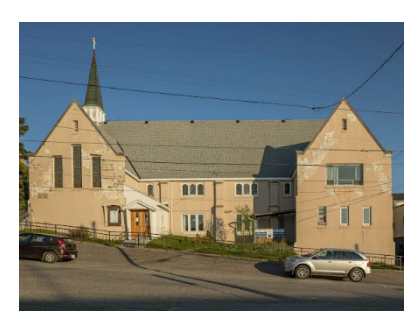
St. Peter's on-the-Rock, Kirkland Lake

Served by Non-Stipendiary retired priest with two nonstipendiary deacons and an acting Lay Reader