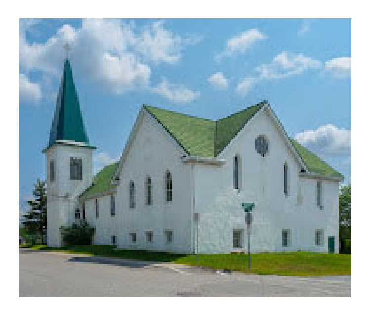
St. Matthew's Cathedral Timmins, Ontario

Synod Administration Office 331 Fifth Avenue, Timmins, ON PoN 1Go