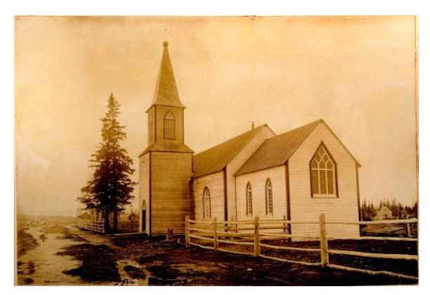
Old St. Thomas Restoration Partnership

In 2023 the Diocese of Moosonee entered into a partnership with Moose River Heritage and Hospitality Association (MRHHA) in supporting the restoration of "Old St. Thomas Church" on Moose Factory Island. Located in northern Ontario, at the southern tip of James Bay, Moose Factory is a community rich in historical significance. St. Thomas Anglican Church was at the heart of this community from the mid-19th