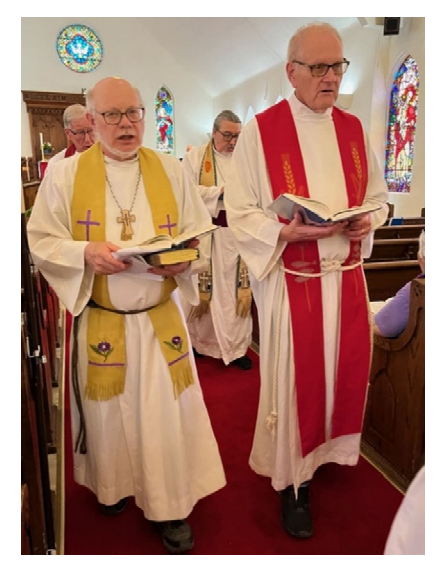
Opening service of June 2024 Synod

Synod 2024 reaffirmed the decision of the June 2011 Synod "to continue as one body of Christ". Since current reporting of our resources (financial, material and spiritual), there has developed a willingness to move forward in faith. The reports showed positive results based on the original 5-year plan "to ensure efficient and effective stewardship." At the June Synod, a unanimous motion to elect a full-time resident bishop was carried. The parishes of the Diocese of Moosonee are committed and 'called by God to live and proclaim the Gospel.'