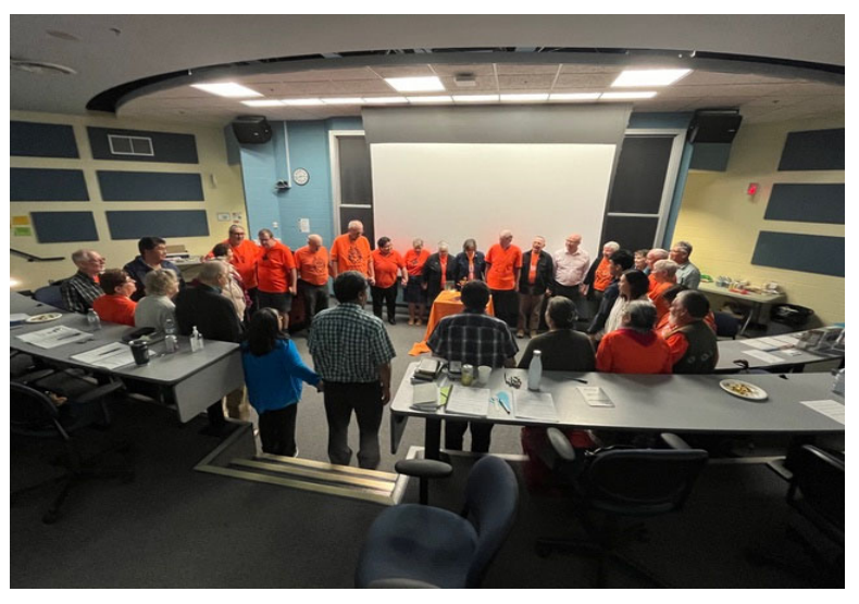
Delegates and attendees gathering in prayer