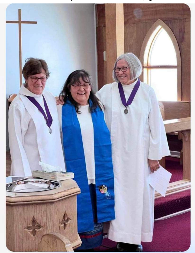
Lay Readers in our Diocese