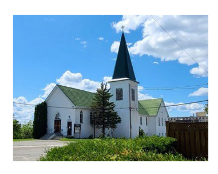
St. Matthew's Cathedral, Timmins